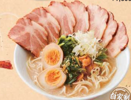
61 满满熟成后的鲜美 猪肉自家制叉烧面 ¥1,600 Full of Mature, Delicious Flavor Homemade Pork Slices and Noodles in Pork Bone Soup