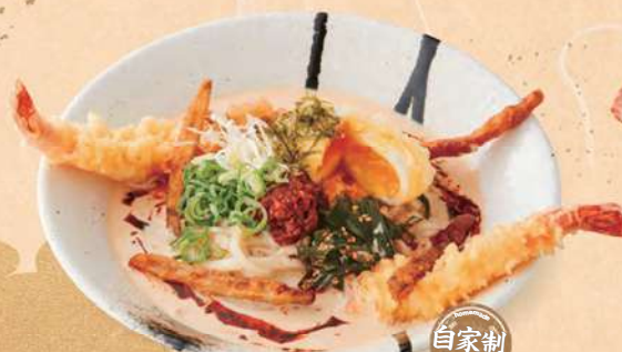
60 让人上瘾的自家制麻辣酱 担担风麻辣烧汁乌冬面 ¥1,400 Addictive Homemade Mala Sauce Udon Noodles with Tantan-style Spicy Soup