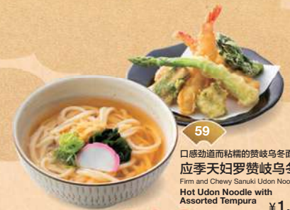
59 口感劲道而粘糯的赞岐乌冬面 应季天妇罗赞岐乌冬面 Firm and Chewy Sanuki Udon Noodles Hot Udon Noodle with Assorted Tempura ¥1,600