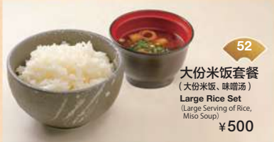
52 大份米饭套餐 (大份米饭、味噌汤) Large Rice Set (Large Serving of Rice, Miso Soup) ¥500