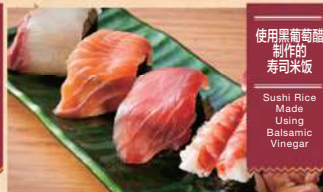
使用黑葡萄醋 制作的 寿司米饭 Sushi Rice Made Using Balsamic Vinegar