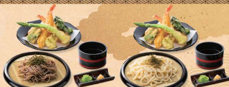
56 浓香顺喉的信州荞麦面 应季天妇罗信州荞麦面 ¥1,600 Highly-aromatic and Smooth Shinshu Soba Noodles Chilled Soba Noodle with Assorted Tempura