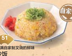
51 满满自家制叉烧的鲜美 炒饭 Filled with the Deliciousness of Homemade Pork Slices Fried Rice ¥600

*我们使用100%日本生产的大米。 *We use 100% Japanese grown rice.