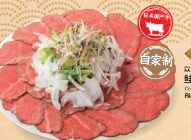
50 使用日本国产生 精心烹制而成的优质赤身肉 烤牛肉盖饭 (包括味噌汤) Carefully Prepared with High-quality Lean Meat Roast Beef Bowl with Japanese Beef (includes miso soup) ¥2,600