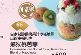
65 自家制猕猴桃果汁冰糕编织 出的幸福和声 猕猴桃芭菲 Homemade Kiwi Sorbet for a Harmonious Blend of Happiness Kiwi Parfait ¥500