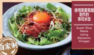
使用黑葡萄醋 制作的 寿司米饭 Sushi Rice Made Using Balsamic Vinegar