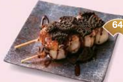
64 略带苦味的点缀 炙烤团子×炙烤棉花糖 & 巧克力曲奇 A Slightly Bitter Accent Grilled Dumplings + Roasted Marshmallow & Chocolate Cookies ¥600

*图片仅供参考。*根据备料状况，食材，菜单可能会有变更。*包括消费税。 *Photos are for illustrative purposes only. *Ingredients and menu items are subject to change depending on availability. *Consumption tax included.