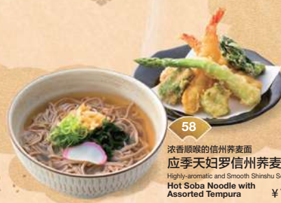
58 浓香顺喉的信州荞麦面 应季天妇罗信州荞麦面 Highly-aromatic and Smooth Shinshu Soba Noodles Hot Soba Noodle with Assorted Tempura ¥1,600