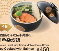
49 以香醇高汤煮至丰满蓬松 鲑鱼杂炊饭 Cooked until Fluffy Using Mellow Soup Stock Rice Cooked with Salmon ¥450