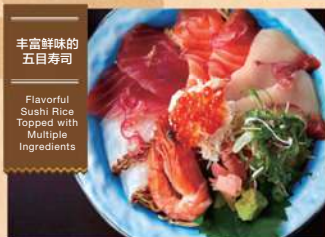
丰富鲜味的 五目寿司 Flavorful Sushi Rice Topped with Multiple Ingredients