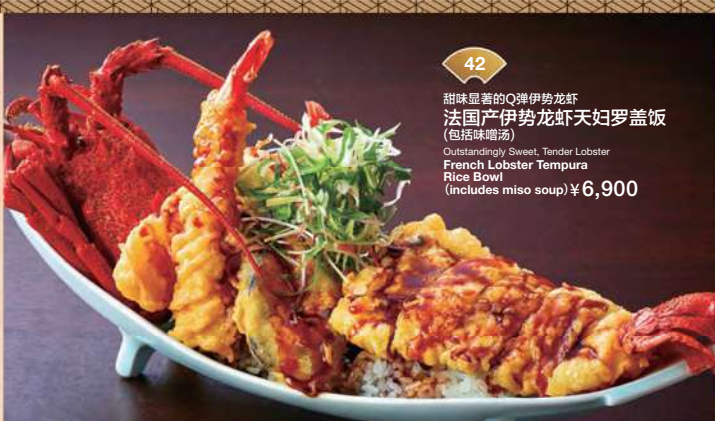
42 甜味显著的Q弹伊势龙虾 法国产伊势龙虾天妇罗盖饭 (包括味噌汤) Outstandingly Sweet, Tender Lobster French Lobster Tempura Rice Bowl (includes miso soup) ¥6,900