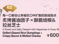
62 每一口都会让幸福在口中扩散的甜咸甜点 炙烤酱油团子×酥脆培根 & 拉丝芝士 A Sweet and Salty Dessert with Happiness in Every Bite Grilled Glazed Rice Dumplings + Crispy Bacon & Melted Cheese ¥600