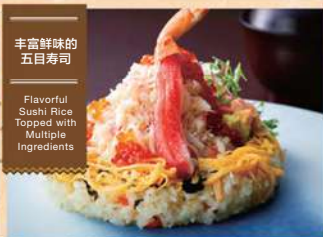
丰富鲜味的 五目寿司 Flavorful Sushi Rice Topped with Multiple Ingredients