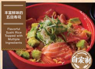
丰富鲜味的 五目寿司 Flavorful Sushi Rice Topped with Multiple Ingredients