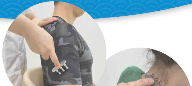
People whose arms are tired from using a computer